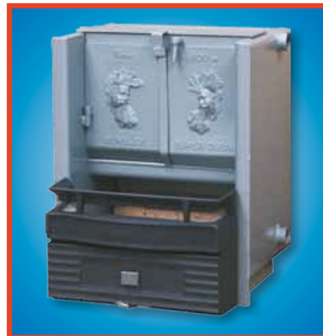
Superclean, Metallic Black Enterprise front