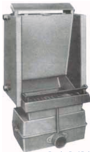
Dunsley Baxi Boiler