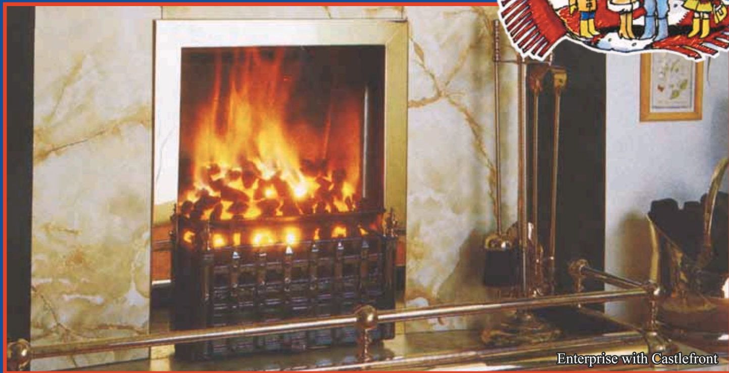
Enterprise with Castlefront