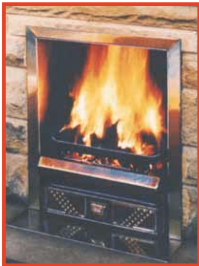
Dunsley Flued Boiler with Firefly Fire & Deepening Bar Available in Copper Luster Enamel and Metallic Black