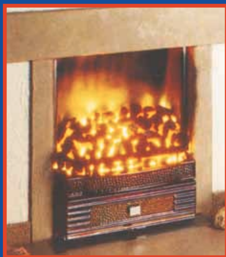
18" Enterprise in Copper Lustre

Available in 16" (400mm) + 18" (450mm) - in Copper Lustre enamel and Metallic black