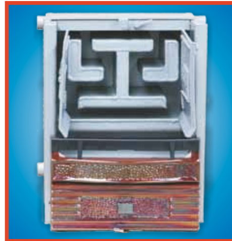
Superclean, Copper Luster Enamel Enterprise front shown with doors in the open position

Dunsley Flued boilers are very efficient having proved themselves over many years. They are designed to standard size and shape. The flue damper arrangement enables the flue to be partly closed in varying positions giving full control of boiler outputs. Because these boilers are of standard shape and size any standard fire can be used, but for best performance use the Dunsley Firefly fire. Dunsley fires will burn wood and peat in addition to coal or smokeless fuels. Ideal for the smaller 2 to 3 bedroom dwelling. Available in 400mm (16") or 450mm (18"). The 400mm fire will take logs 250mm (10") long. The 450mm fire will take logs 290mm (11.5") long.